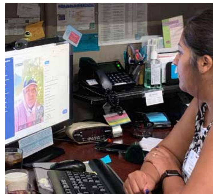
A mom videoconferences from her workplace, in an agricultural job, for her WIC appointment.

Videoconferencing presents a multisensory alternative to in-person one-to-one counseling and education, with the ability to reach clients remotely. With physical presence requirements being relaxed during the pandemic, some WIC local agencies successfully conduct video visits for all types of verification appointments - including mid-