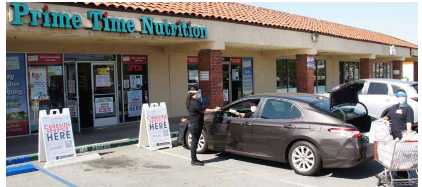
Participants can complete their ordering on line, but must complete the purchase transaction and pick up groceries curbside/at the store. Online ordering and purchase transaction, and delivery is a recommended improvement.

responsive approach is critical if WIC is to reach more families in need.