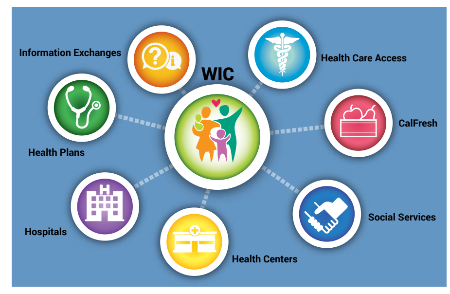
Linkages between WIC and other programs would benefit more eligible families.

In California, the state Department of Public Health (CDPH), manages the California WIC program by contracting with 84 local agencies that provide direct services. Compared to other federal benefits programs, which are often managed at the local level by county health departments, California WIC local agencies are administered by six types of local parent organizations. At the time of the survey, 39 county health departments served approximately 38%