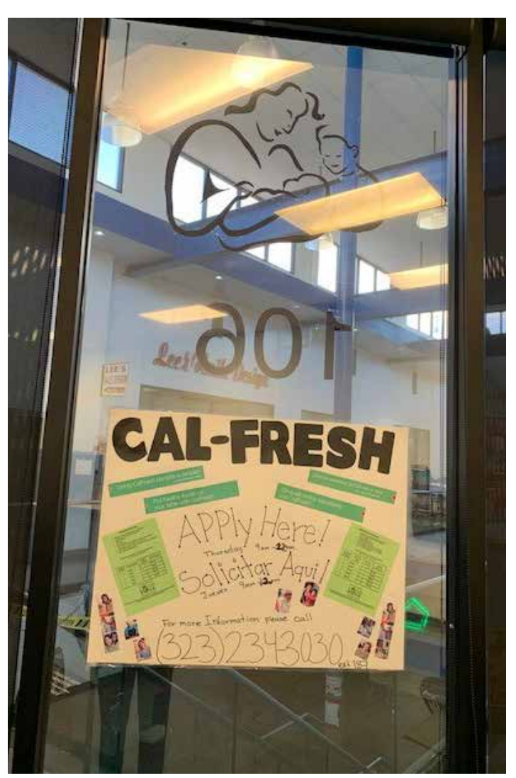
With more remote services expected, onsite application assistors may be less effective.

Thirteen local WIC agencies, nine of which are located in county health departments, have MOUs to share information with a variety of social service programs, including Head Start; a food bank with access to CalFresh information; and public health nursing, which could make referrals to WIC from several programs such as Black Infant Health and home visiting programs. In some cases, ENPs are identified and contact information supplied. In one case, referrals are made with a warm hand-off when staff from other programs accompany WIC-eligible participants to the WIC office in the same building.