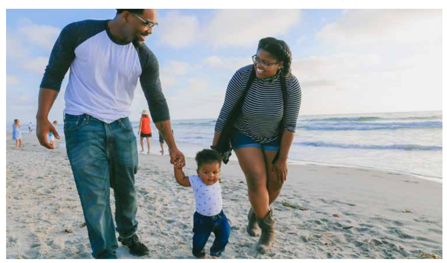
Linking families to health care, social services, and WIC through horizontal integration and technology can benefit entire communities.

As an essential and cost-effective program, WIC has a consistent record of positive health outcomes, including reduced anemia, preterm delivery and low-birth weights, improved breastfeeding rates, and lower childhood obesity rates. These and other positive outcomes make WIC an increasingly important link with health care and social service programs. <sup>3,4</sup>