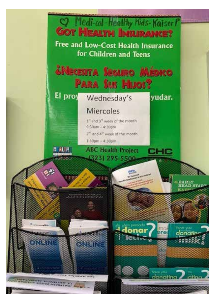
For many years WIC local agencies have hosted onsite application assistors for Medi-Cal and CalFresh.

The application portal for Covered California marketplace health plans can also direct individuals to an application for Medi-Cal health plans. The portal provides another long pathway to WIC, however. On page 19 of the 26 application pages, individuals can check a box that brings more information about CalFresh or CalWORKS (California Work Opportunities)