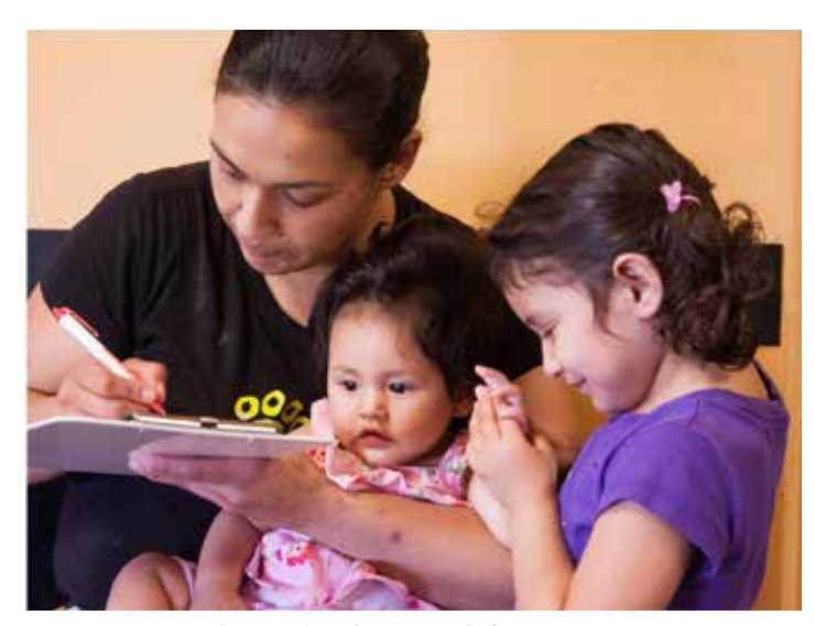
Busy parents need streamlined program linkages