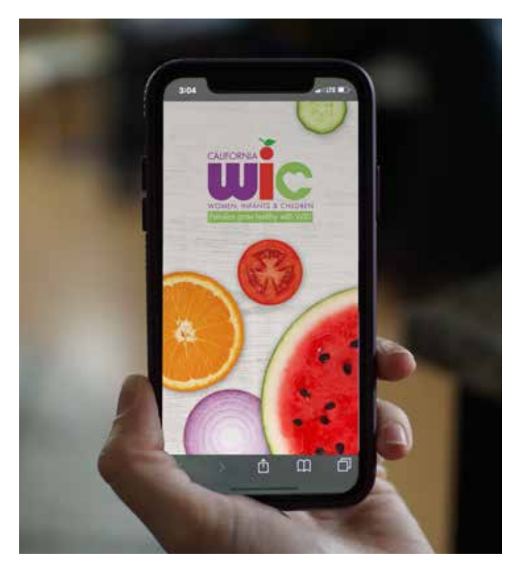
The new California WIC app could be a key part of horizontal integration, linking WIC participants with other needed services using technology young families expect.

The state's current goal is that by 2024 there will be one electronic information and application portal through the California Statewide Automated Welfare System (CalSAWS), supported by the California Healthcare Eligibility, Enrollment and Retention System portal (CalHEERS). <sup>23-27</sup> WIC is not included in the current work underway for the new system, but plans should begin for CalSAWS to be configured to include simultaneous exposure to WIC.